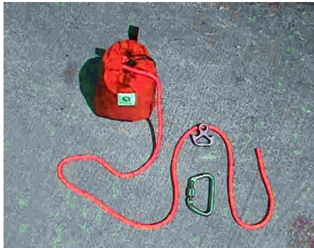
Figure 5 Illustration of Firefighter Escape Line Kit

the time of this writing, the VHFD is purchasing four Firefighter Escape Line Kits (see figure 5). These escape line kits meet the criteria of NFPA 1983, Standard on Life Safety Rope and System Components. Distributed by CMC Rescue, Inc., this portable escape kit allows for a quick safe descent from an area of danger up to five to six stories high. Norman (1997, pg. 18), in outlining the required equipment needed for a RIT team, recommends a NFPA rated personal rope consisting of a 40 foot length of 3/8 kernmantle rope.