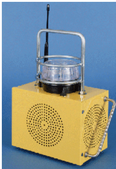
Figure 6 Illustration of a Target Exit Device

As previously noted, the National Fire Protection Association (NFPA) has stated that, in some years, 20% of fireground fatalities are related to firefighters becoming lost or disoriented in buildings. In order to provide a safer environment for firefighters conducting primary searches at structure fires, the Vestavia Fire Department is purchasing two Target Exit Devices (TED) (see figure 6). The TED is an exit locator for firefighters. According to the manufacturer, Safety System, Inc., "When placed at the entrance to the fireground, lost or disoriented firefighters can follow the highly directional sound and powerful strobe through heavy smoke, and return to a safe exit."